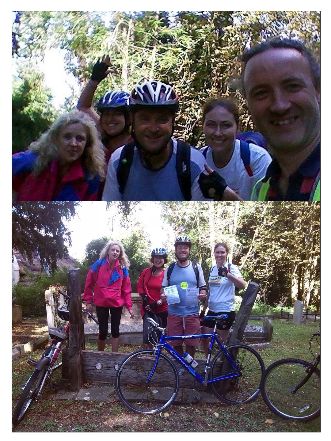
Pictures taken during the Sponsored bike ride—see page 7.